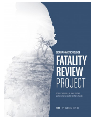
Cover from the 12th annual Fatality Review Report

The current edition of the Project is now available online .