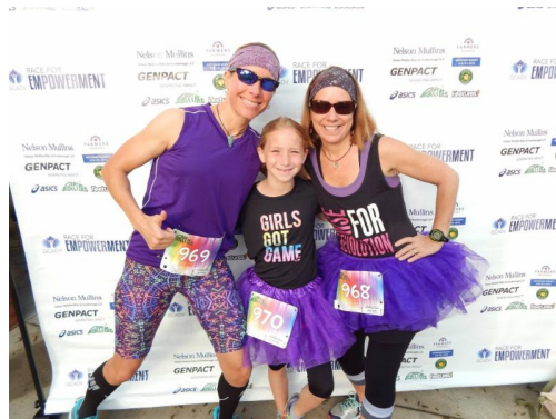
Racers at the 2nd Annual Race for Empowerment.

The winner of the Purple Torch Award for the second year in a row was the YWCA of Northwest Georgia. The Purple Torch was presented to the member organization team with the fastest combined time.